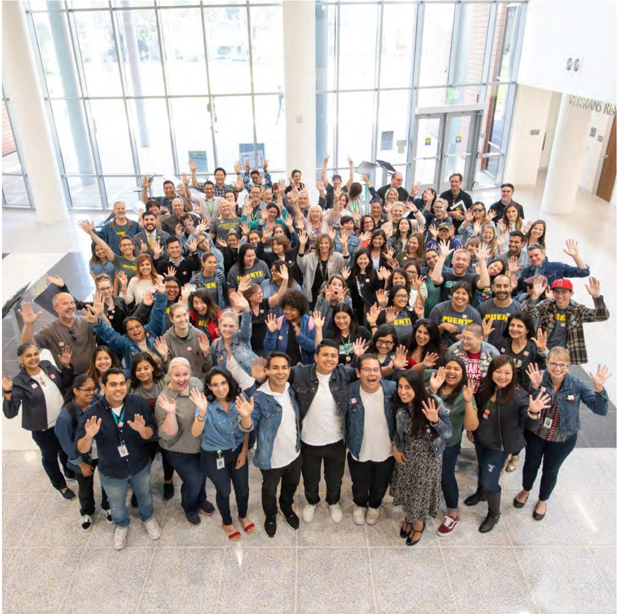
GWC students and staff proudly support #DenimDay, April 24, 2018.