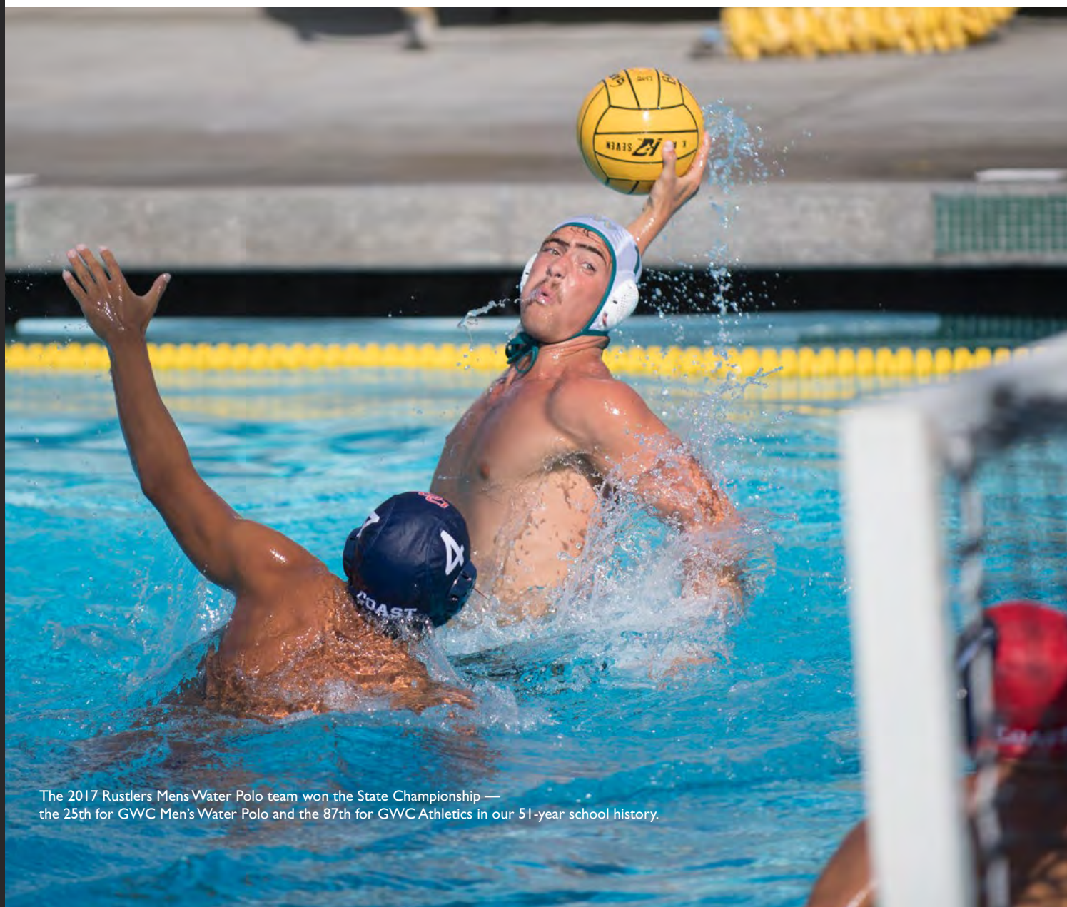
The 2017 Rustlers Mens Water Polo team won the State Championship — the 25th for GWC Men's Water Polo and the 87th for GWC Athletics in our 51-year school history.

B.A., M.A., California State University, Fullerton