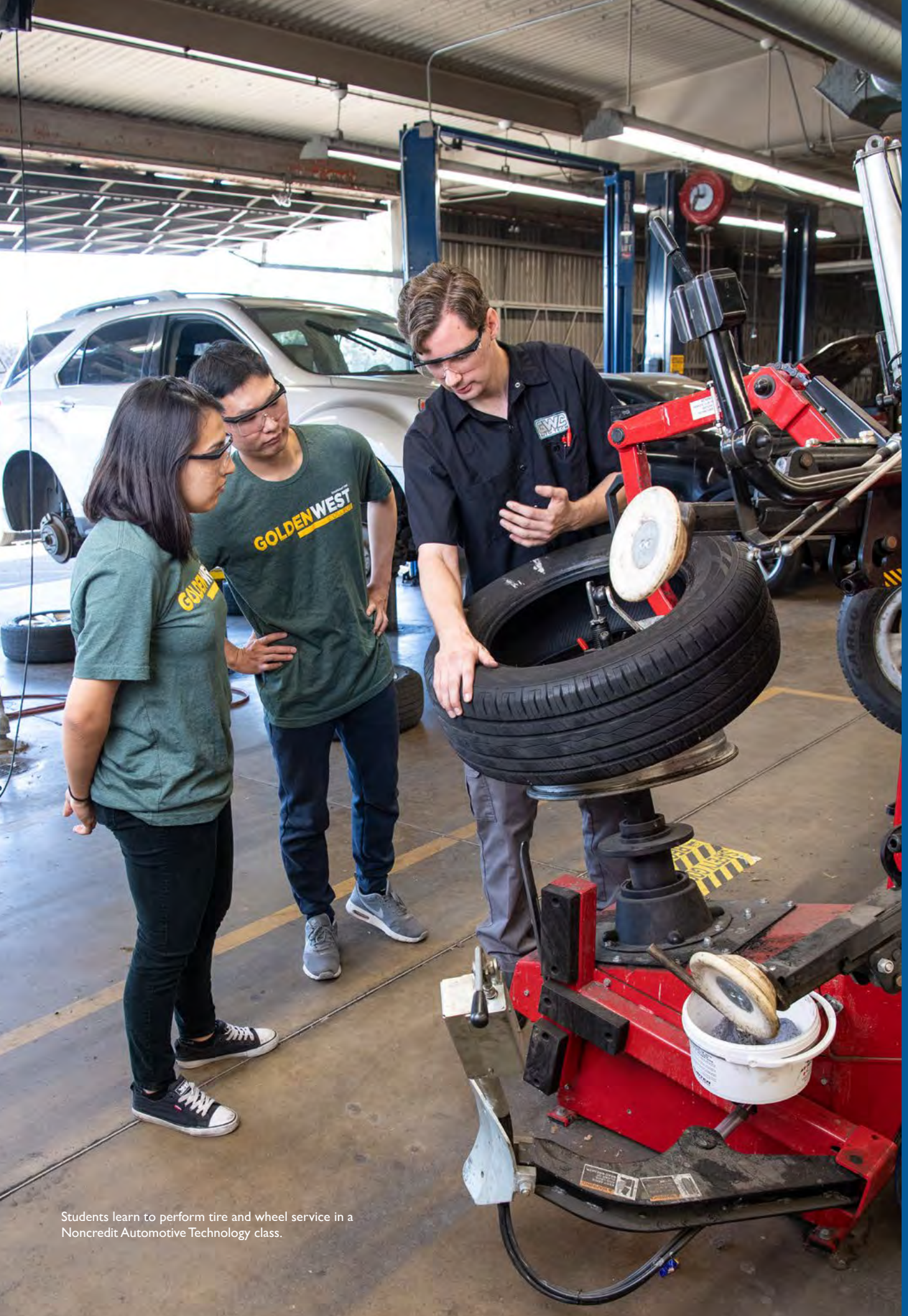
Students learn to perform tire and wheel service in a Noncredit Automotive Technology class.